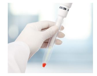
Narrow centrifuge tubes